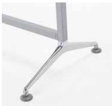
Foot detail (5210-P, 5210-PBO 5211-P, 5211-PBO)