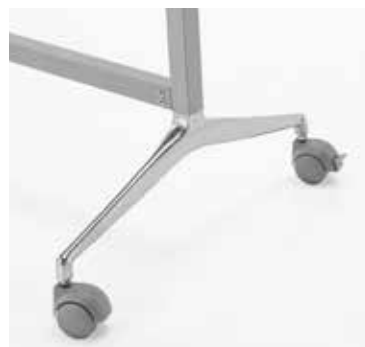
Castor detail (5210-R, 5210-RBO 5211-R, 5211-RBO)