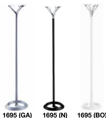
1695 (GA) 1695 (N) 1695 (BO)