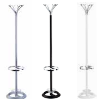
1696 (GA) 1696 (N) 1696 (BO)